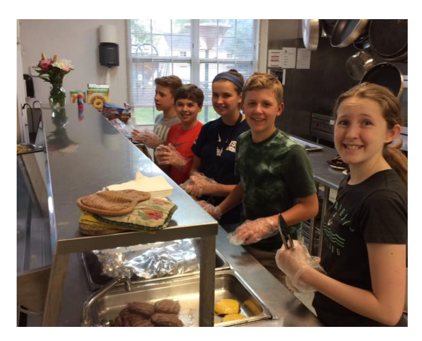
Members of our Youth Group served dinner to residents of the Light House shelter in Annapolis recently.